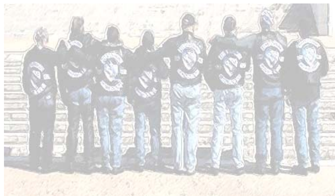
San Jacinto Monument ride Oct. '05