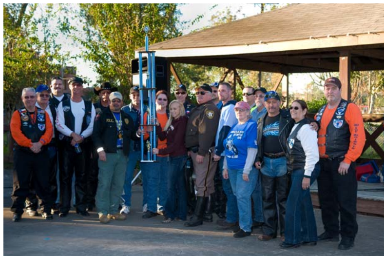
Alvin Blue Santa – Blue Knights win most participation 2 nd year in a row!

(Note: The ride will be cancelled if rain forecast is greater than 50%)